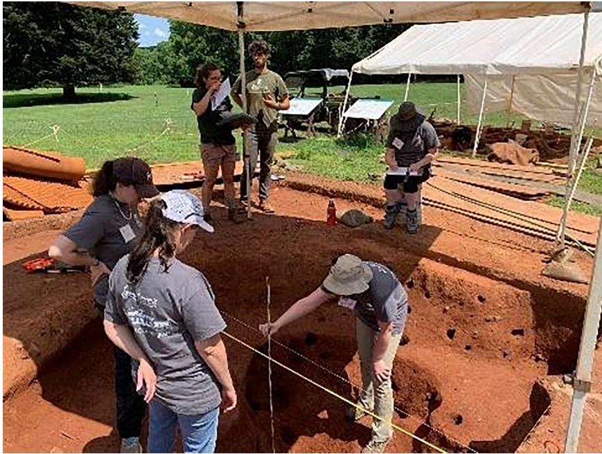
Fig. 4 LEARN Teacher program participants in 2019.