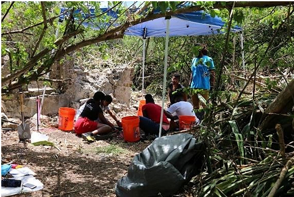
Fig. 3 Students from the Boys and Girls Club in Frederiksted excavate at Estate Little Princess, St. Croix (O'Connor 2018).

exclusively extractive and destructive practice. For further reading, see Dunnivant et al. (2018).