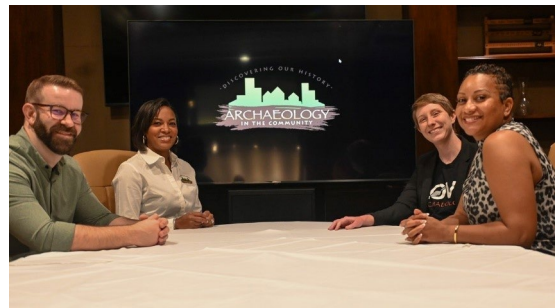
Fig. 1 Archaeology in the Community staff.

AITC has operated an annual five- to six-week Young Archaeologists' Club, introducing children aged 7–12 years to the interdisciplinary practice of archaeology starting in 2014. The program introduces students to STEM topics as well as some of the specific topics, challenges, and advantages of archaeology. Each program offers lessons on different topics, each with a hands-on activity, and a field trip to a museum or nearby archaeological site. The