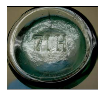
Figure 11 – 71 H (Tuscon Urban Renewal collection)

This mark is also listed by Markota and Markota (2000:22). However, it is likely that the "657-H" mark is a typographical error for "657 / H." The authors attributed the mark to the Holt Glass Works, although they dated its use on the California Bottling Works Hutchinson containers from 1905 to