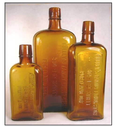
Figure 5 – Gulley's flasks

All sources but McCoy included date ranges for individual bottles and/or companies that used them (i.e., not dates for the marks). In general, these date ranges fit within or overlapped the Toulouse dates for the Holt Glass Works. However, a few exceptions in both Fowler (1998) and Elliott and Gold (1988) were too late for the Toulouse date range for Holt. McCoy (n. d.:2) suggested three possible manufacturers for the mark: Holt Glass Works (1893-1906), Hart & Co. (1889-1918), and Dunkirk & Co. (ca. 1900). Other sources only mentioned Holt.