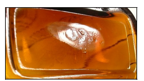
Figure 6 – Gulley's base

Elliott and Gould (1988:113, 127, 136, 138-139, 144, 155-156, 189) listed nine examples of the {number} / H mark, and Fowler (1998:15, 22-24, 26, 37, 41, 43, 50, 69, 72-73) added 15 more. Miller (2008:19, 68, 83, 100, 142) illustrated five bottles with the same "H" mark – although with different numbers (Figure 7). Markota and Markota (2000:30, 38, 48, 53, 97) listed five numbers found on Hutchinson bottles as well as the letter "H" with no numbers and two other slight variations. Colcleaser (1965:35, 56; 1966:14, 32-33) showed bottles with the typical mark (e.g., 423 / H). McCoy (n. d.:2) illustrated