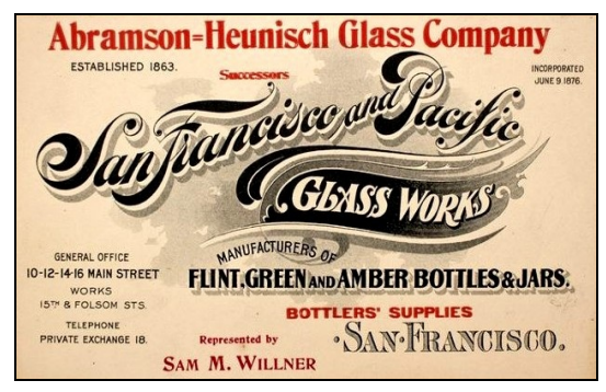
Figure 3 – Abramson-Heunisch Glass Co. card

About 1896 Abramson-Heunisch partnered with the Illinois Glass Co. to open an office in Chicago as the U.S. Bottlers & Supply Co., but Illinois Glass acquired the Abramson-Heunisch share of the firm two years later (Figure 2). In 1898, possibly using funds from the Chicago sale, Abramson-Heunisch purchased a two-fifths interest in the San Francisco & Pacific Glass Works, entering the production end of the glass business (see the