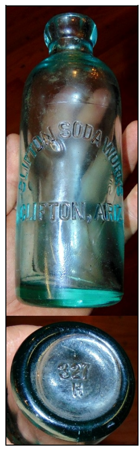
Figure 7 – H logo (Robert Hines)