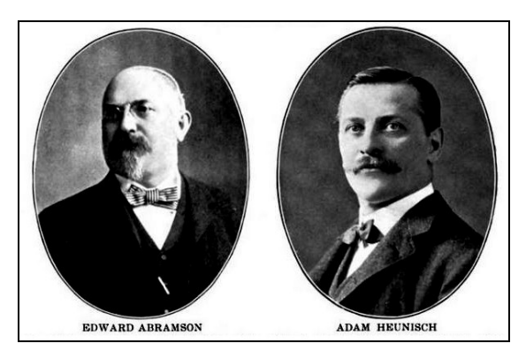
Figure 2 – Abramson & Heunisch (Pacific Art Co. 1901:303)