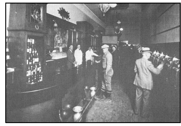
Figure 7a-9 – Inside the Mint