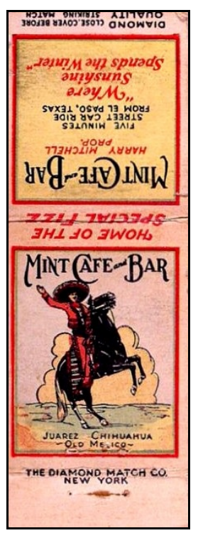
Figure 7a-7 – Matchbook from the Mint (eBay)

Finished in a green color scheme to fit its name, the Mint is a cool, inviting café where men may take their wives and families and where an air of quiet refinement makes the wonderful food and service doubly enjoyable.