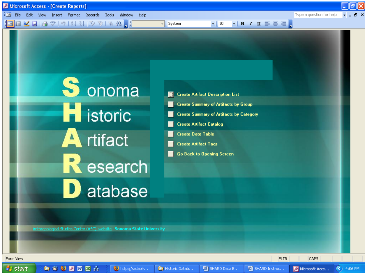
Figure 3. Reports Menu Screen.

To generate each report, simply click on the appropriate button and fill in the feature number.