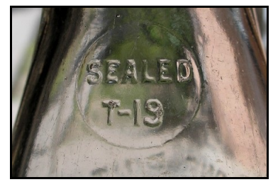
Figure 4-13 – Sealed T-19

11) "SEALED / 14" in two lines on the shoulder (not in a circle) (Figure 12)