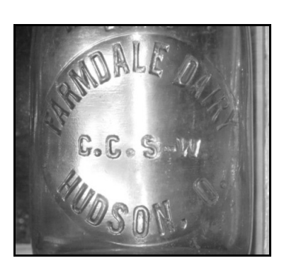
Figure 4-17 – C.C.S.-E 1 (Antique Bottles.net)

The initials "CCS" followed by a single letter appeared on numerous Ohio milk bottles. The Dairy Antique Site (2016) noted that the letters indicated the Cleveland City Sealer of Cleveland, Ohio. The site added that the city "required the milk bottle manufacturer to post a