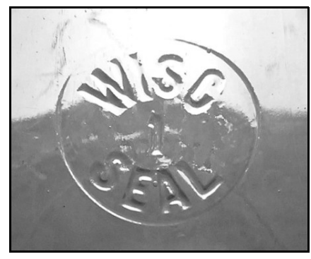
Figure 4-16 – Wisc 1 Seal

As with the other seals described above, the examples were mostly taken from 153 eBay auctions, and we need a much larger sample.