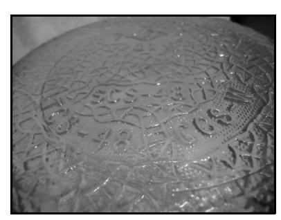
Figure 4-24 – C.C.S., T.C.S. & S.C.S. (eBay)

W = <(0)> (Owens-Illinois Glass Co. – purchased Berney-Bond in 1930)