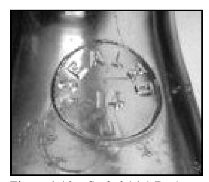
Figure 4-10 – Sealed 14 (eBay)

We have not found examples for most of these. As usual, of course, the Thatcher Mfg. Co. made the most common bottles, but the firm was incredibly inconsistent in its markings. We have recorded the following configurations for Thatcher: