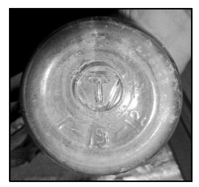
Figure 4-25 – Travis T-19-12 (eBay)

The city of Toledo (T.C.S.) and Sandusky (S.C.S.) used similar systems, and dairies that served all three municipal areas embossed bases with all three logos (Figure 24). The initials were probably used between ca. 1908 and the 1960s according to