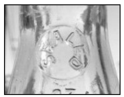
Figure 4-6 – Sealed (eBay)

the same purpose – maintaining uniformity in the capacity of milk bottles. The state probably set the system in place in the late 1920s and continued to use it until all three states abandoned the seals as unnecessary in 1947. By that time, quality control and consistency had become so standard throughout the glass industry that further safeguards were redundant.