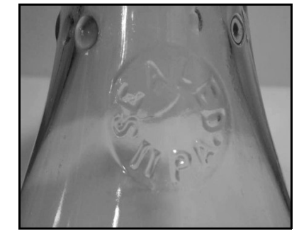
Figure 4-8 – Sealed 11 PA

Although later than the others in this study, the State of Pennsylvania also instituted a seal program ca. 1930. We have recorded a single bottle embossed "SEALED" in a circle in a plate on the front neck/shoulder (Figure 6). The seal had no identifying letter or