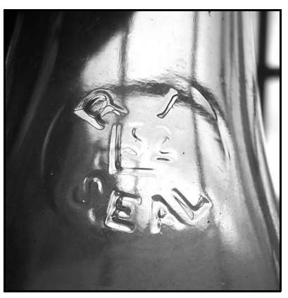
Figure 4-4 - R.I. L52 seal

The Lamb Glass Co. embossed "R.I. (arch) / L52 / SEAL (inverted arch)" on the shoulders of its milk bottles for use in the state of Rhode Island (Figure 4). The firm opened in 1921 and adopted the L52 logo (with "52" in the crook of the "L") ca. 1929. The Dorsey Co. absorbed Lamb in 1963. The seal was probably used in Rhode Island from 1929 to 1947.