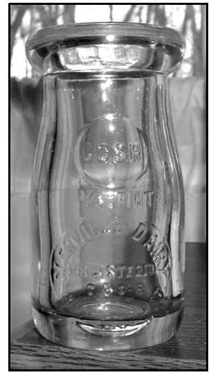
Figure 4-23 – C.C.S.-E 9 (eBay)

The CCS code is followed by another single letter, including C, D, E, F, O, P, R and W, according to the Dairy Antique Site (2016) and Dennis Osborn (Personal communication