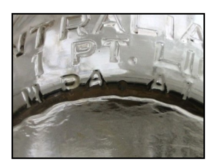
Figure 4-9 – Sealed 11 PA (eBay)

number, but it was on a bottle with a Thatcher heelcode and a date code for 1930. By at least 1933, the state apparently included numbers and/or letters. An example was embossed "SEALED (arch) / 11 / PA. (both horizontal)" in a circular shoulder/neck plate – again with a Thatcher logo and 1933 date code (Figure 7). By 1940, at least some of the shoulder seals had changed, now reading "SEALED (arch) / 11 PA. (inverted arch) (Figure 8)." At least one bottle was embossed "SEALED