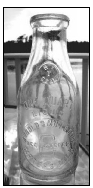
Figure 4-5 - R.I. T seal

Although Rhode Island seems to have adopted the seal system later than its neighbors, Massachusetts and Maine, it used the seals for