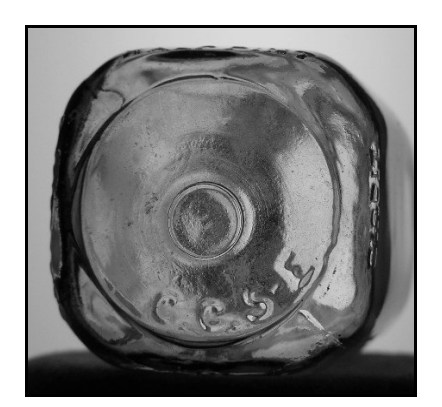
Figure 4-22 - C.C.S.-E 7