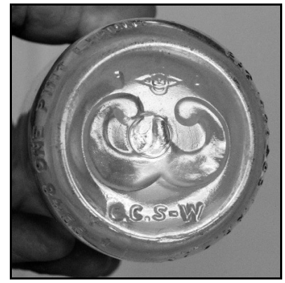
Figure 4-21 - C.C.S.-E 6 (eBay)

In some cases, the initials occurred on both a plate (either on the front body or shoulder) and on the