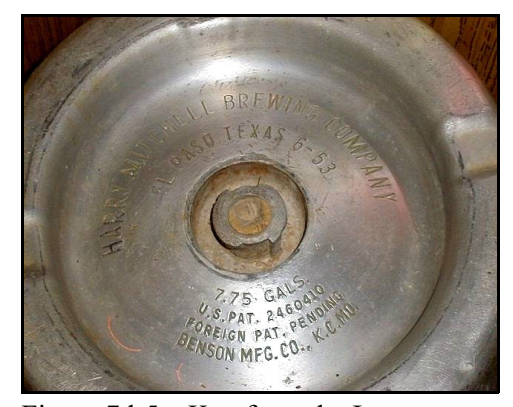
Figure 7d-5 – Keg from the Last Corporation (Elaine Sleeman collection) [Photograph by Dale Sleeman]

In an uncited article from the Hennech collection, Kuper described some of the operations in 1953. Unlike the Czechoslovakian hops used in 1934, the company now bought special Haas Golding hops from the Yakima Valley, Washington. He noted that "domestic hop has proved to be the best for making a fine beer." The brewery now sold beer in draft form as well as "packaged beer [in] bottles, cans and one-way glass bottles" (Figure 7d-5). From its original fleet of 11 vehicles, the company now operated 17 trucks and nine passenger cars. The plant filled, capped, and labeled 240 12-ounce bottles of