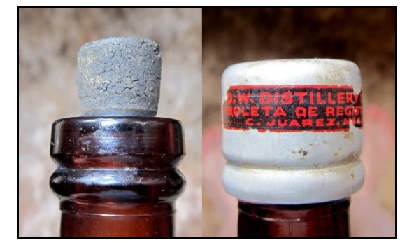
Figure 5d-21 – Finish, cork, and cover used on later single-serving flasks

The most recent (1937) one-serving (1/10th pint) flask had a two-part (double-ring) finish that was sealed by a cork. The entire cork/finish was concealed by an aluminum cover that affected an outer seal. This was opened by a tear-strip encircling the center of the cover. Atop the tear-strip was a red-outlined black decal that read: "D.W. DISTILLERY Co. S.A. / BOLETA DE REGISTRO C-11 / C. JUAREZ, MEXICO" in red