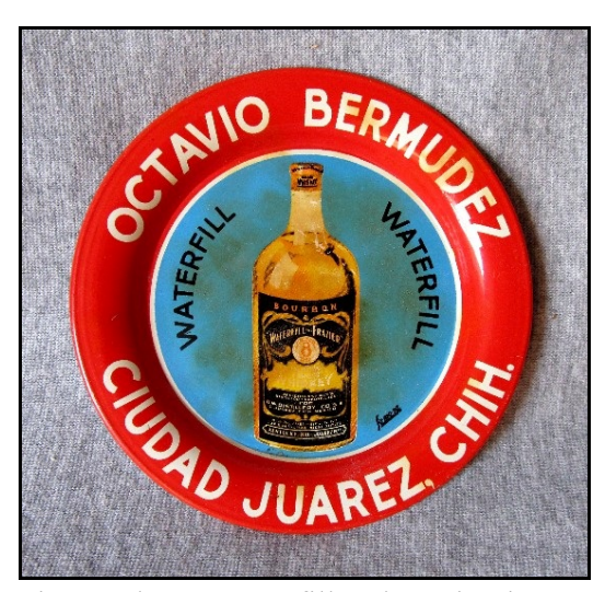
Figure 5d-13 – Waterfill and Frazier tip tray

The D.W. Distillery Co. bottled Waterfill & Frazier in at least three sizes: quart, pint, and 1/10th pint. It is likely that half-pint flasks were also available, possibly quarter-pints as well – but I have not seen either of those. The firm used at least three styles of quart bottles. Unfortunately, I have only seen one style on a serving tray (see Figure 5d-8), one on a tip tray (Figure 5d-13), and the other in a newspaper ad (see Figure 5a-18).