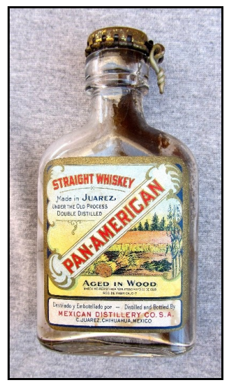
Figure 5d-5 – Later Pan American flask

Although the basic layout was the same, the name "PAN-AMERICAN" was now hyphenated, and the newer label was more colorful. "JUAREZ WHISKEY" had been changed to "STRAIGHT WHISKEY" and the 100-proof designation was gone. The next lines read "Made in Juarez / Under the Old Process / Double Distilled." At the bottom of the label, only the name had been changed to "MEXICAN DISTILLERY CO. S.A."