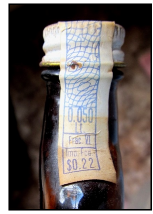
Figure 5d-18 – Later tax stamp "$0.25"

Two other types of continuous-thread finishes appeared on larger bottles and flasks. The earlier of these was apparently shown on the earliest tray (see Figure 5d-8). As noted in Chapter 5c, Leslie R.N. Carvalho applied for a"Bottle Cap" patent on November 3, 1927, and received Patent No. 1,712,103 on May 7, 1929 (see Figure 5c-14). He noted that "tear-off or rip strips" were already known for use on the skirts of caps. The caps probably began use in late 1927 of Waterfill & Frazier quart bottles.