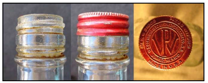
Figure 5d-19 – Continuous-thread finish on pint flask

The last ad I have found for Waterfill & Frazier quart bottles (see Figure 5a-18) showed a similar style, called a pilfer-proof cap, that