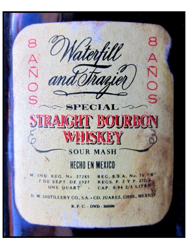
Figure 5d-22 – Earliest Waterfill and Frazier (white) label – single-serving flask

ONE QUART • CAP. 0.94 2/3 LITRO / D.W. DISTILLERY CO. S.A. • CD. JUAREZ, CHIH., MEXICO / R.F.C. / DWD 20606 (all in black