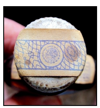
Figure 5d-17 – Eagle-and-Rattlesnake on cap top

An interesting feature on these screw caps was the import tax stamp. This was glued from one shoulder of each tiny flask across the top of the cap and down to the opposite shoulder. The earliest of these was white with "Imp. Fed. / $0.22" in blue ink on the two sides and the Mexican national symbol of an