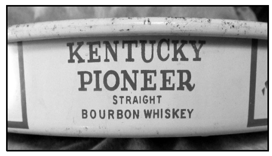
Figure 5d-10 – Kentucky Pioneer ad on side of tray

This is a difficult brand to trace. I only know of it from two sources. One of these was a serving tray that featured a quart-sized bottle of Waterfill & Frazier whisky on the front. The announcements on the high sides of the tray alternated between Waterfill & Frazier, Pan American, and "KENTUCKY / PIONEER / STRAIGHT / BOURBON WHISKEY" (Figure 5d-