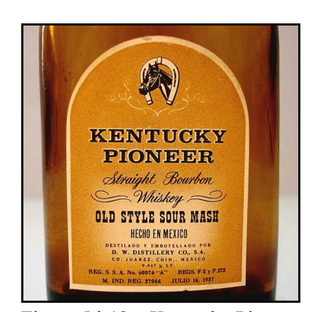
Figure 5d-12 – Kentucky Pioneer label

JUAREZ, CHIH,. MEXICO / 0.047 ½ LT. / REG. S.S.A. No. 60076 "A" / REGS. F-2 y P.272 / M. IND. REG. 27066 JULIO 16, 1927" (Figure 5d-12). Unfortunately, the seller failed to include information on the base of the flask.