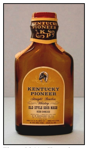
Figure 5d-11 – Kentucky Pioneer flask

10). As noted above, the tray was almost certainly made at or near the inception of the D.W. Distillery at Juárez.