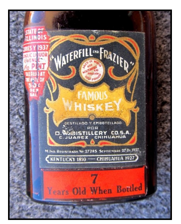
Figure 5d-25 – Last Waterfill and Frazier label from Juárez with 1937 Illinois tax stamp

At some point, the central number in the "AGED IN WOOD" ball became a "6" – although the rest of the label remained