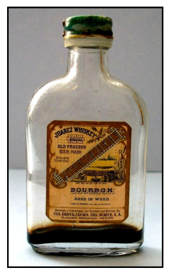
Figure 5d-2 – Early Pam American flask (eBay)

Below was "BOURBON / AGED IN WOOD" with "Destilado y Embotellado por Distilled and Bottled by / CIA. DESTILADORA DEL NORTE, S.A. / C. JUAREZ, CHIHUAHUA, MEXICO" (Figure 5d-1).