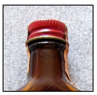
Figure 5d-16 – Continuous-thread finish and cap – small bottles

An interesting feature on these screw caps was the import tax stamp. This was glued from one shoulder of each tiny flask across the top of the cap and down to the opposite shoulder. The earliest of these was white with "Imp. Fed. / $0.22" in blue ink on the two sides and the Mexican national symbol of an