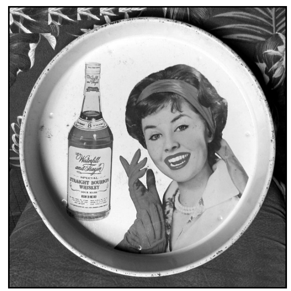
Figure 5d-8 – Waterfill & Frazier serving tray

The only connection between Pan American whiskey and the D.W. Distillery Co. is a serving tray that featured a lady's face, along with a quart-sized bottle of Waterfill & Frazier whisky on the front (Figure 5d-8). The high sides of the tray alternated between blurbs for Waterfill & Frazier, Kentucky Pioneer and "Pan American / OLD / BOURBON & RYE WHISKIES" (Figure 5d-9). As noted above, Pan American was the featured brand of the Mexican Distillery.