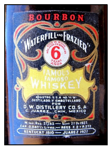
Figure 5d-24 – Waterfill and Frazier black label with "6 YEARS"

unchanged (Figure 5d-24). Although I have no evidence to back up this assertion, the "6 Years" ball was probably used throughout the remainder of Prohibition and the earliest years after the Repeal. See the discussion section below for a discussion about the aging process.