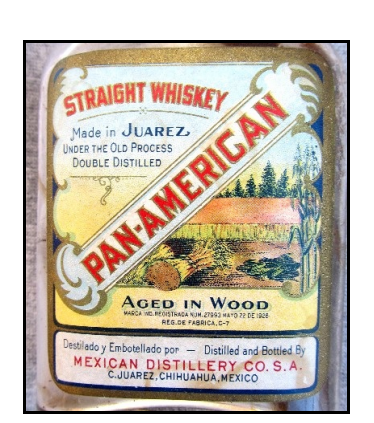
Figure 5d-4 – Later Pan American label

The newer label clearly evolved from the one described above.