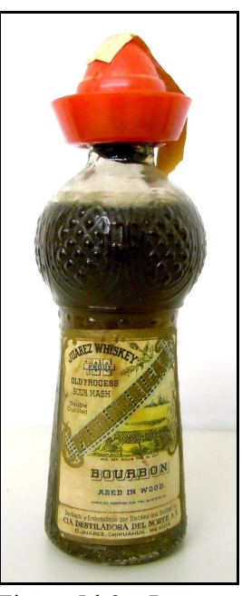
Figure 5d-3 – Pan American "Mexican hat" bottle

appears to have been corked, it was capped with a red plastic top that resembled a Mexican sombrero (Figure 5d-3).