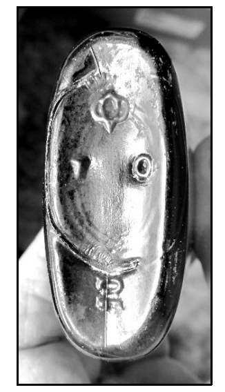
Figure 5d-26 – Base of bottle with 1930 date code

Langston (1874:232-233) noted that the D.W. Distillery Co. began production in 1927. The only label I have seen for Pioneer Whiskey (distilled and bottled by D.W. Distillery) had a July 16, 1927, registration date, and every label I have discovered on Waterfill and