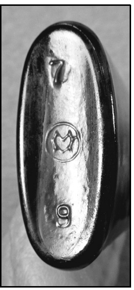
Figure 5d-23 – Base of the earliest Waterfill and Frazier single-serving flask

An early single-serving flask had an identical label except that "8 AÑOS" had been added in red in a vertical line on each side of the Waterfill and Frazier designation (Figure 5d-22). This was probably the earliest label, roughly contemporary with the one on the serving tray. The base of the flask was embossed "7 / Circle VM / 9" (Figure 5d-23). The