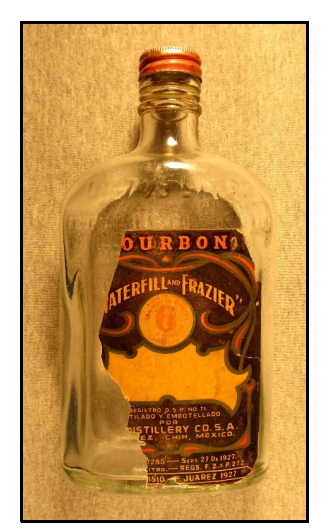
Figure 5d-14 – Waterfill and Frazier pint flask

The bottle on the serving tray is certainly the oldest, probably used in 1927. It was cylindrical with embossed bands on the shoulder and heel and a long neck. The heel band was embossed "D.W. DISTILLERY CO. S.A." The next bottle – shown on a tip tray – was shorter and stouter, with a much shorter neck. The final one – illustrated in a 1934 ad – was cylindrical with a long neck but no shoulder or heel bands. All three were colorless.