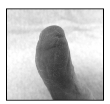
Figure A-20 – Grooves in the thumb from the force of pushing the larger "button"