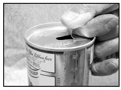
Figure A-5 – Rolling the pull-tab – note the thumb contact with the sharp edge of the tear-strip

After the initial baptism, most of us experimented with ways to open the can without getting the beer bath. Our plan, after all, had been to drink the beer – not wear it. After a few other interesting failures, most of us found the same method – one virtually guaranteed to create pop-top thumb. First, we turned the can 45 degrees – so that the opening (or what we hoped would soon become the opening) pointed to our right – for right-handers, that is. As in the initial attempt, the body of the can was gripped with the left hand).