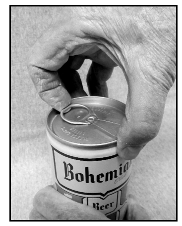
Figure A-11 – Ring-pull – setting the finger

The trick was to keep the ring low enough so that it would not catch on anything and accidentally break the seal, while elevating it for easy access to the hopeful drinker. Each firm dealt with the issue in a different way. American built up a