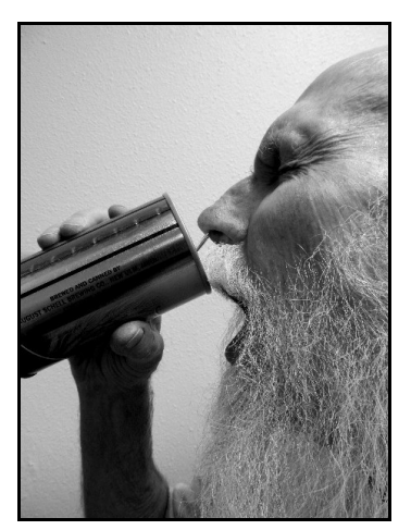
Figure A-28 – Ouch!

knows what great improvement – or what possible new injury – the next development may hold. Stay tuned.