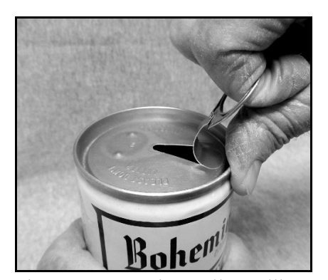
Figure A- 13 – Ring-pull – Pulling the ring

C-shaped plateau on the top of the can that elevated the ring pull and added a crescent groove to facilitate access. Continental punched two dents in the top of the ring, itself, making tiny "legs" in the bottom that raised the ring. Both ways may have helped, but the operation still required each step.