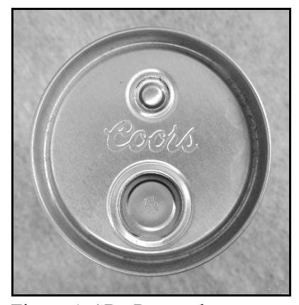
Figure A-17 – Press-tab can top

Bill Coors was very concerned with litter, so he adopted one of the earliest push-button or punch tops. Although other breweries also adopted cans of this type, Coors was the largest and best known. The top of the can had two raised circular areas with an indented circle in the center of each. Inside the indent, another circle – called a "button" – was incised about 96% of the way around. One of these was much smaller and was designed as an air inlet vent to facilitate easy pouring. The larger one was the actual pouring opening (Figure A-17). Each