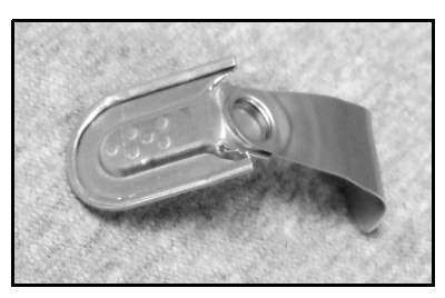
Figure A-9 – Bottom of pull-tab

Figure A-8 – Tab stuck to the thumb by sheer pressure of opening strip rolled off the can top, its sharp edges came into direct contact with the lower ball of the thumb, sometimes creating a sometimes bloody slice in the skin. The sheer pressure of forcing the