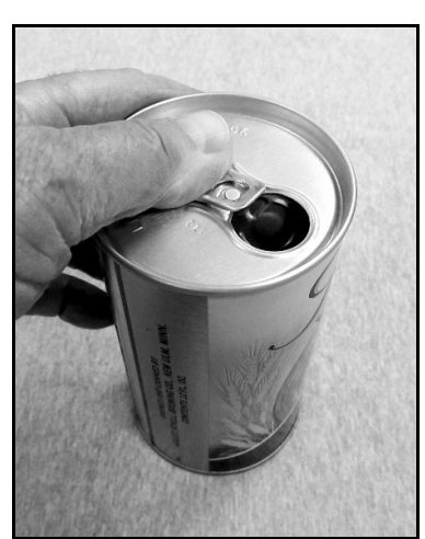
Figure A-26 – Pressing the tab back down

It was apparently impossible, however, to design a self-opening can that would work in less than two stages, and this final attempt takes three. Even this technology requires that the finger be wiggles under the edge of the tab prior to lifting it into a more-or-less upright position (Figure A-22). At this point, the thumb presses down on the top of the rivet to act as a fulcrum, and the second joint of the index finger pulls the tab forward depressing the tear strip into the can (Figures A-23 & A-24). As with the