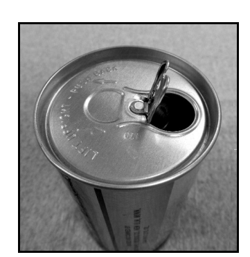
Figure A-25 – Tab in the upright position

condition is relatively rare; virtually everyone – except the very young, the mentally incompetent, and the notably inebriated – intuitively spots the protruding tab and presses it down. Those who fail to notice rarely repeat the error.