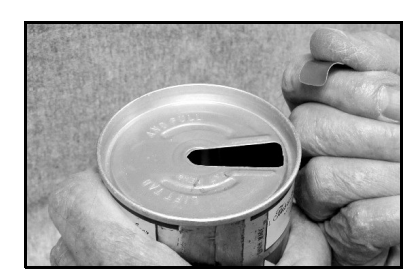
Figure A-7 – Freeing the tab

The only really effective grip was with the joint of the thumb and the second joint of the index finger. This created a firm grip on the entire surface of the tab. Meanwhile, the second knuckles of the middle and index fingers (or just the index finger on those with large hands) acted as a fulcrum, allowing you to effectively sever the tear strip in a smooth, rolling motion – while still holding the beer can upright (Figures A-5, A-6, & A-