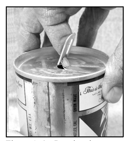
Figure A-4 – Popping the top

really strong thumbnails, that was out. Even though some tabs were slightly bent on the end to facilitate slipping a finger under them, most of us held the can with the opening side toward our stomachs, wiggled the tip of the index finger under the edge of the tab, braced the thumb of the same hand against the edge of the can as a fulcrum, and pulled forward (Figures A-3e & A-4). This raised the tab with a slight popping sound – hence, the name "pop-top."