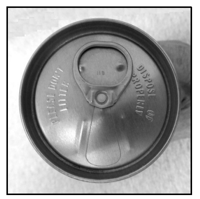
Figure A-10 – Ring-pull can top

As with the lift tab, opening a ring-pull can was a two-