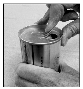
Figure A-24 – Depressing the tear-strip