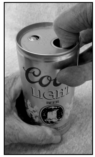
Figure A- 19 – Pushing the larger "button"

It did not always work without cussing, however. The smaller button was virtually problem free. Most of us just licked the occasional drop of Coors off of the thumb. Unfortunately, the second button was large enough so that the end of your thumb pushed into the opening – with considerable force (Figure A-20). As you have probably guessed by now, this created an entirely different form of pop top thumb.