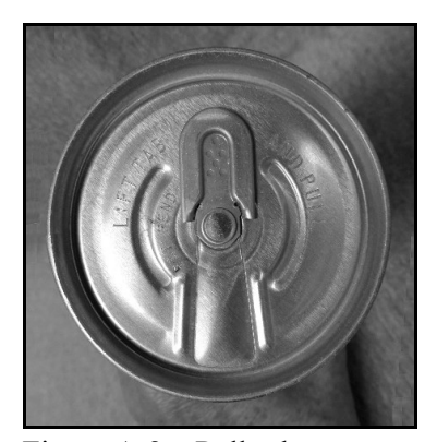
Figure A-2 – Pull-tab can top

Eliminating the external opener was a brilliant move. The 1962 invention of a built-in lift tab or pull tab created an instantly available opener as an integral part of the can. If you had the can, you also had an easy way to access the liquid (Figure A-2). Or, possibly easy. Sometimes the tab on the early tops broke off, leaving the drinker to either find something to poke the incised tear strip into the can or open the can the old-fashioned way – with the external opener.