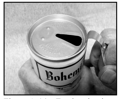
Figure A-14 – Freeing the ring

In step two, the thirsty individual grasped the can with the non-dominant hand (tear strip pointing at the stomach), inserted his or her index finger inside the pull ring, placed the thumb of the same hand on rim of the can,