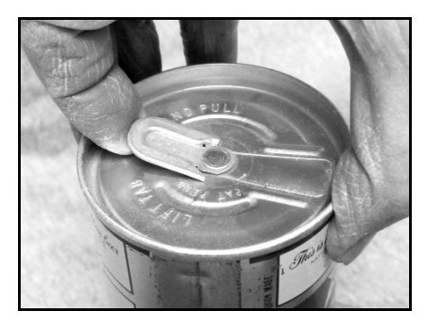
Figure A-3 – Pull-tab – ready to pull

I'm not sure anyone has really looked at the mechanics of opening these cans, before. It is pretty clear that the inventors never thought it all the way through. I suspect that there were other methods, but I - and everyone I ever watched – followed a two-step format. First, the tab