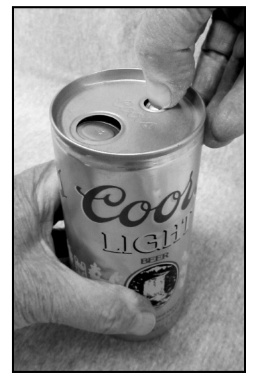
Figure A-18 – Pushing the vent "button"

It did not always work without cussing, however. The smaller button was virtually problem free. Most of us just licked the occasional drop of Coors off of the thumb. Unfortunately, the second button was large enough so that the end of your thumb pushed into the opening – with considerable force (Figure A-20). As you have probably guessed by now, this created an entirely different form of pop top thumb.