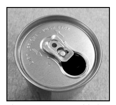
Figure A-27 – Can with the tab pressed down

Invented in 1935, the flat-top beer can has survived now for almost eighty years. Its only major rival, the cone-top can, used the crown cap in an attempt to copy bottles – and it has long vanished. Returnable bottles, too, have almost disappeared, although non-returnable glass containers continue to hold a market share. Who