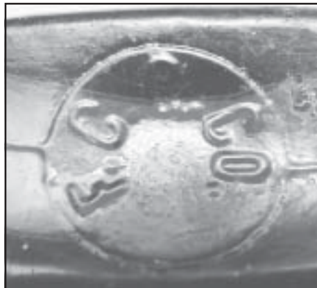
Mark on the base of Falls City amber whiskey flask (shown in photo above).