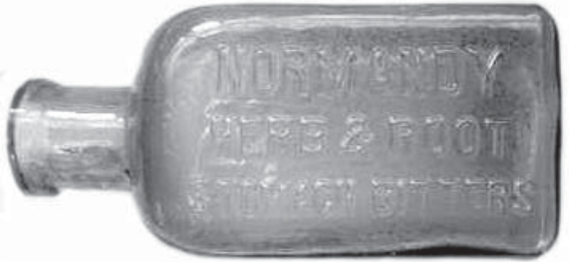
Orange amber Normandy Herb & Root Stomach Bitters bottle, marked "F.C.G.CO.", circa 1890.

There are probably many other types of bottles which carry this marking that exist and may eventually be discovered during privy digs, especially within Louisville and in the surrounding area.