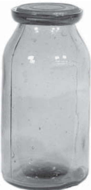
Yellow Olive Quart wax sealer marked "F.C.G.CO."

chemical bottles, mini whiskey samplers, Worcestershire sauce bottles and other kinds of generic utility bottles with the F.C.G.Co. mark on the bottom. A yellow-amber bottle marked "Normandy Herb & Root Stomach Bitters" carries this glassmark. These bottles are known in two sizes, and come in both marked and unmarked versions.