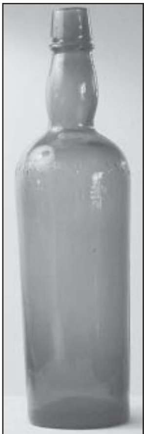
Orange-Amber 'Brown, Thompson & Company' lady's leg whiskey, circa 1885, marked "F.C.G.CO"

Falls City seems to have made glassware that has been found in a wider variety of shades of color when compared to the production of the other factories in Louisville during that time period. Glass production (most notably the wax sealer fruit jars) is known in several