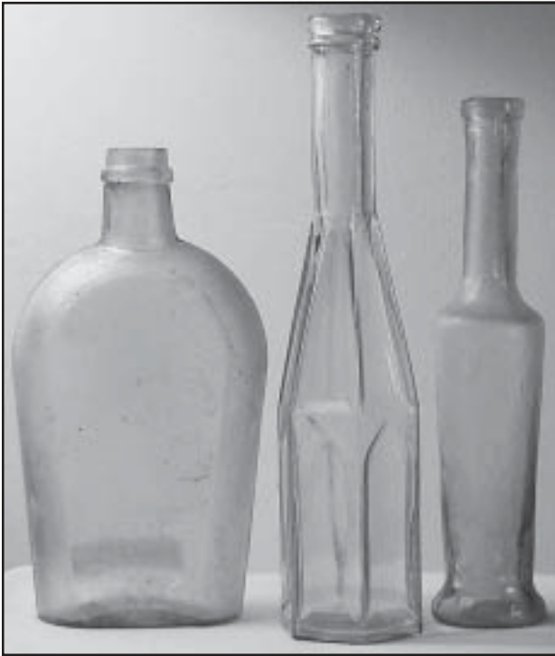
A group of three Falls City bottles: Coffin whiskey flask, Gothic Cathedral Peppersauce (6-sided), and typical olive oil bottle of the 1880s period. All are marked "F.C.G.CO."

chemical bottles, mini whiskey samplers, Worcestershire sauce bottles and other kinds of generic utility bottles with the F.C.G.Co. mark on the bottom. A yellow-amber bottle marked "Normandy Herb & Root Stomach Bitters" carries this glassmark. These bottles are known in two sizes, and come in both marked and unmarked versions.