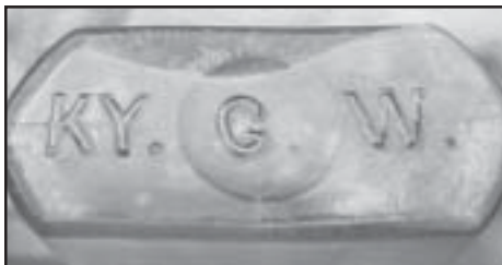
Closeup of maker's mark on the base of a Kentucky Glass Works Company "coffin" flask, circa 1880s.

This factory was located on the southwest corner of 4 th and "C" Streets, which, at the time, was considered to be the "southern outskirts" of the city of Louisville, just south of the area which is now termed "Old Louisville." C Street was later re-named Avery Street, situated in the University of Louisville campus area. This factory was sometimes casually referred to as simply the "Kentucky Glass Works," although this company dates nearly 30 years after the founding of the original factory of that