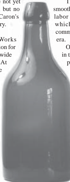
Squat ale bottle in amber, blob lip. Marked "KY.G.W.Co."

On January 26, 1881, at about 5:00 in the morning, a fire swept through part of the KYGW factory property, and several outbuildings were destroyed including the blacksmith shop, pot-house and several wood frame sheds. The fire was believed to have started between the sand-drying and mixing rooms, with a total loss estimated at $10,000, which was reported to be fully covered by insurance. All of the clay pots were ruined and a quantity of beer bottles were destroyed as well. However, management assured reporters that the ruined buildings would be quickly rebuilt and there would be virtually no interruption in the filling of