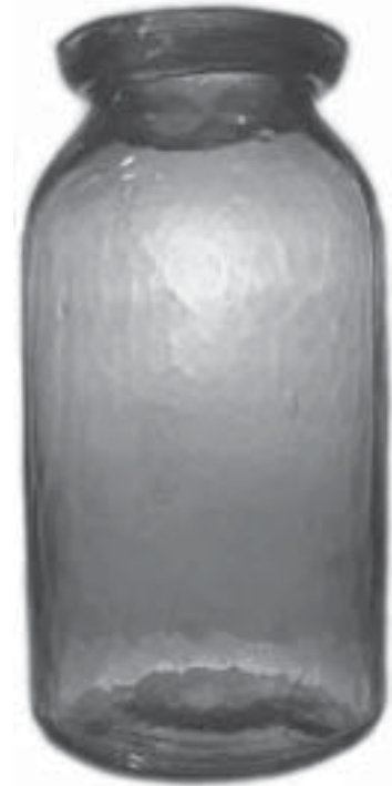
Yellow olive green quart wax sealer fruit jar, marked "KY.G.W.CO."