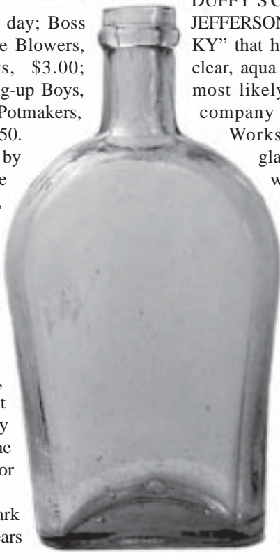
A coffin flask from Kentucky Glass Works Company. This variant is marked “KY.G.Co.”

The most common mark is “KY.G.W.” which appears on wax sealer fruit jars, medicine and bluing flasks, coffin flasks, various Louisville-area blob-top