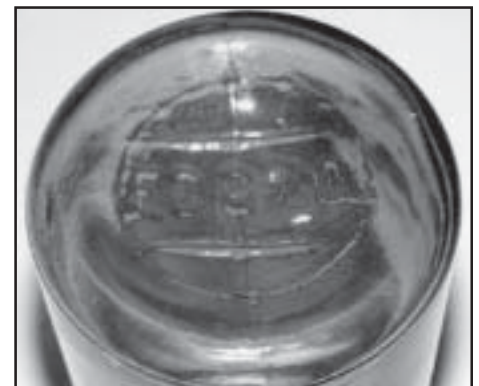
Closeup of the F.C.G.CO. mark on an olive green Falls City wax sealer.

This firm evidently lasted only about a year and a half, as the next piece of