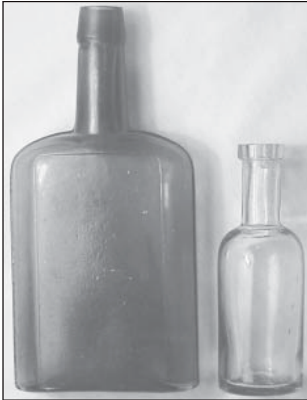
A duo of Falls City bottles: Amber whiskey flask and small whiskey sampler in aqua. Both are marked "F.C.G.CO."