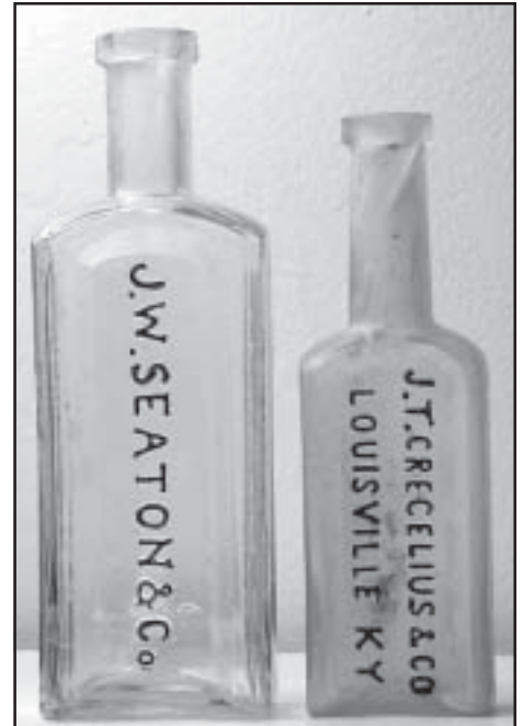
Two Louisville medicine bottles, likely products of a Louisville glasshouse. The J.T. Crecelius & Co. bottle dates from c.1885, and was probably made by KYGWCO; the Seaton bottle dates from sometime between 1865 and 1885, exact glasshouse source is uncertain. Both are private mold bottles, and do not carry a glasshouse mark.

An extremely scarce glass target ball in aquamarine (it is believed that only two examples are known) used for trap-shooting, carries the embossed name of a hunting or sporting goods supply store (Joseph Griffith & Sons), with the wording “Kentucky Glassworks Company”