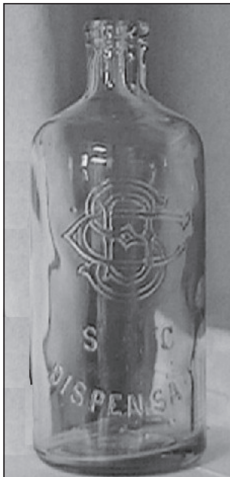
Figure 2: South Carolina Dispensary bottle (eBay)