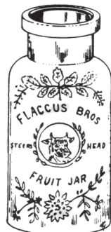
Figure 8 (L): Flaccus Brothers Steershead Jar (Creswick 1987:61)

Creswick (1987:60-61) illustrated and described 11 jars and accompanying lids made or used by the Flaccus Brothers [Figures 8 and 9]. All of these bore the Steershead" trademark. She did not include date ranges for any of the jars, and they were not marked by any manufacturer's marks. The Steers Head was first trademarked (# 21,314) by the Flaccus Brothers for a paper catsup label on June 21, 1892, with first use claimed in 1880. The mark was again registered (#67,527) for use on a large variety of products by Edward C. Flaccus on February 4, 1908, but there was no first use date (Creswick 1987:258, 260).