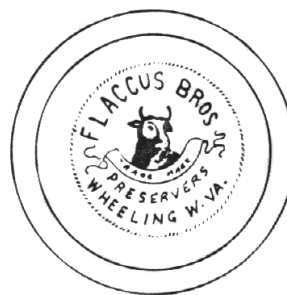
Figure 9 (R): Flaccus Brother Steershead Lid (Creswick 1987:61)

Toulouse (1969:295-296) illustrated and described four variations of food jars with the FLACCUS BROS. and STEERSHEAD marks but noted that there were "many slightly changed versions of the decoration forms of each jar listed." Toulouse dated the jars ca. 1890-1898 and claimed that they were probably made by the Hazel Glass Co. or Atlas Glass Co.