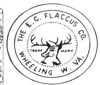
Figure 11 (R): E.C. Flaccus Stag Brand Lid (Creswick 1987:61)