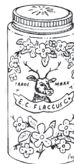
Figure 10 (L): E.C. Flaccus Stag Brand Jar (Creswick 1987:61)

Creswick (1987:61) only illustrated a single style of jar and lid for E.C. Flaccus with a fancy design on the embossed body label and the trademarked stag head of the Stag Brand [Figures 10 and 11]. Toulouse (1969:117-118) discussed three variations of the jars and illustrated the complex design. He dated the jars ca. 1890 and noted that they were probably made for Flaccus by the Hazel Glass Co. In his later book, he was more vehement, dating the