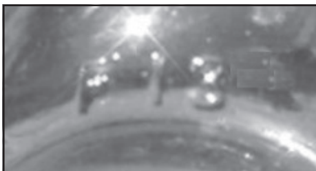
Figure 6: F 13 on a Milk Bottle Base (Albert Morin)

Albert Morin (personal communication, 3/4/2007), reported that all milk bottles with the FL Massachusetts seal that he has seen were marked "F 13" on the heel [Figure 6]. It is highly possible that the "F 13" mark has been seen on other milk bottles but not identified with Flaccus.