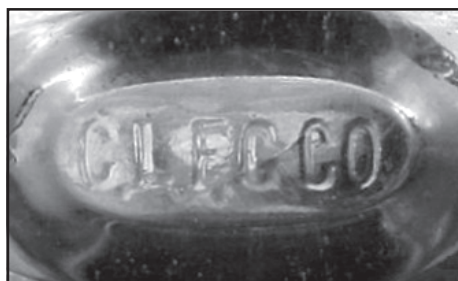
Figure 3: C.L.F.G.CO. on the Base of a South Carolina Dispensary Flask

initials blown into their bottles was a quality control measure that resulted from having more formal and specific bids and contracts. All of the glass house contracts from 1897 forward in the Dispensary records at the State Archives carry this provision.