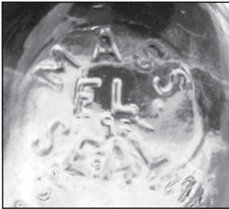
Figure 5: FL Massachusetts Seal (Albert Morin)

From 1910 to 1947, the Commonwealth of Massachusetts required that all glass factories selling bottles to dairies within the state mark their containers with a Massachusetts seal. From some point after 1910, factories embossed the seal on the shoulder of each milk bottle, usually in a circular form embossed "MASS (arch) / {factory designator} / "SEAL (inverted arch)." These often appeared in a small plate mold. The mark used by Flaccus was "FL" (Blodget 2006:8; Schadlich [ca. 1990]). In at least some cases, the FL seal was placed on the center body of milk bottles in a plate mold (personal communication, Albert Morin, 3/4/2007), although the shoulder seal was more common [Figure 5].