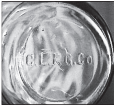
Figure 1: C.L.F.G.CO. on the Base of a South Carolina Dispensary Bottle

The requirement for a glass house supplying bottles to the [South Carolina] Dispensary to have their